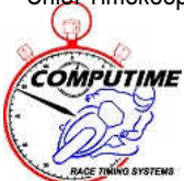
Clerk of Course - Paul Hinds

www.computime.com.au COMPUTIME RACE TIMING SYSTEMS PTY LTD